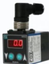
KLV5 - M12